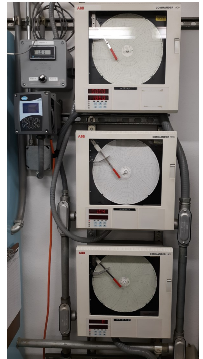
Current paper chart recorder panel.

The SCADA system will act as an alarm system to notify operators of issues, allowing them to prepare to troubleshoot before traveling to a site. With this new system, remote operation and monitoring of our WRF system will be available on-site, off-site and via cell phone.