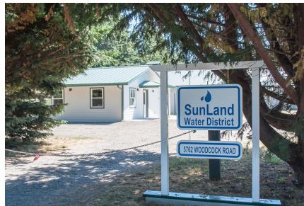
SWD office on Woodcock Road

In this newsletter, you'll find our 2021 rates, staff updates, details on our new process for annual budgeting, planned capital expenditures and other district information.