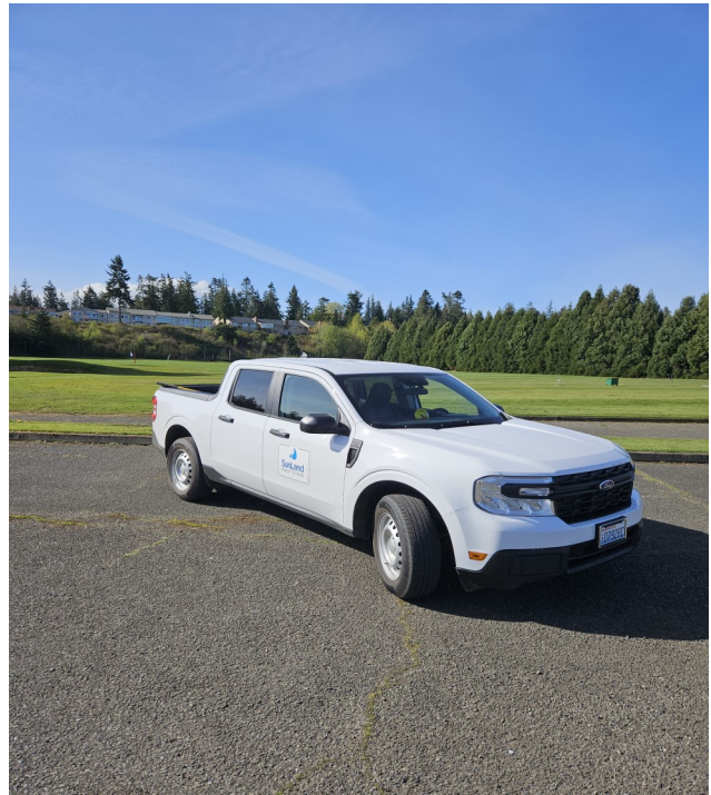
Photo: Ford Maverick Water team truck

Our Ford Ranger is now used at our Wastewater Treatment Facility for occasional local trips.