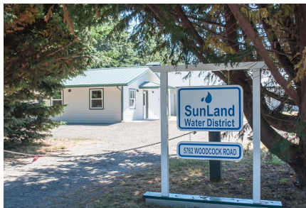
SWD office on Woodcock Road