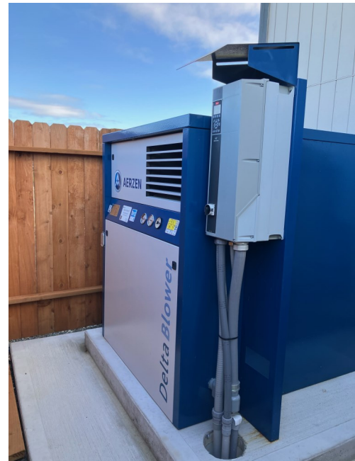
Photo: Treatment plant blower

Our Wastewater Reclamation Facility (WRF)'s blower was aging out at 25 years old. A blower provides aeration for the basins' treatment process. This one blower now does the work of two older blowers.